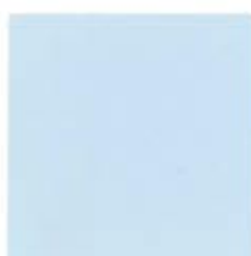
SKY BLUE 780