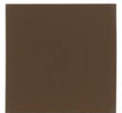
RUST BROWN 675 (DARK BROWN)