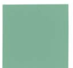
SEAFOAM GREEN 740

NOTE: Colors shown are represented as close as possible. Upon installation, variations can be expected due to differences in cement, aggregates and method of application.